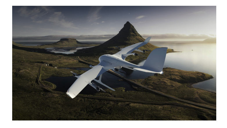
Drone Startup Speeds Up Race for Vaccine Delivery